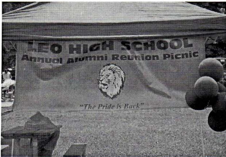
The picture speaks for itself !