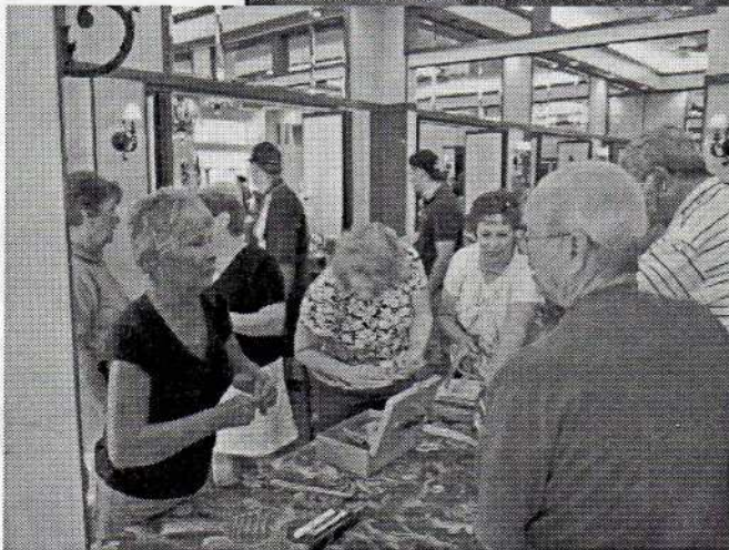
" you pays your money, you takes your chances "