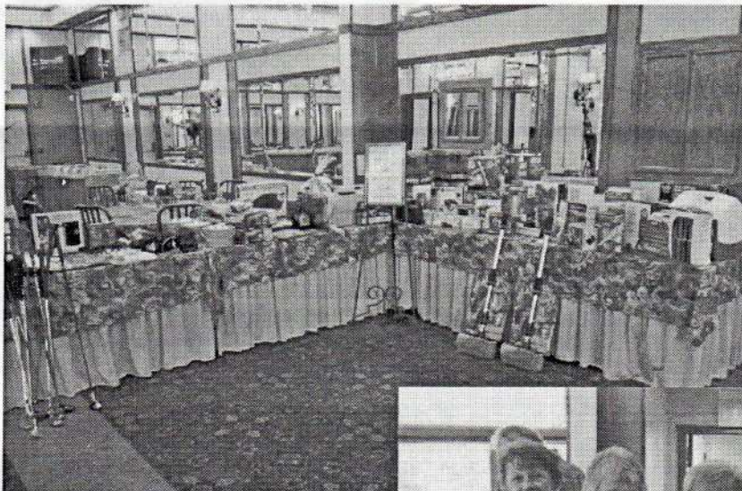
Another spectacular prize table!